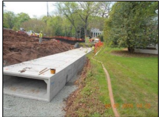
Upper Flat Branch Interceptor Project

Funding continues for the Upper Flat Branch Interceptor.